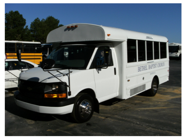
30-Children Seating + Driver

For More Information: Contact Todd B. Manuel at (800) 726-0779 x 125 www.interstatetransportation.com